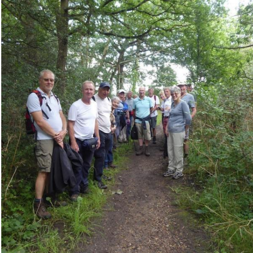
Photo call during a summer walk