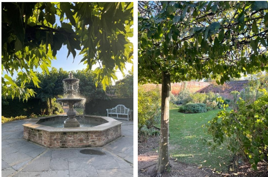
Couple of views taken at Braxted Park

At the close of the afternoon, we were served tea and delicious cakes. A very successful visit enjoyed by all.