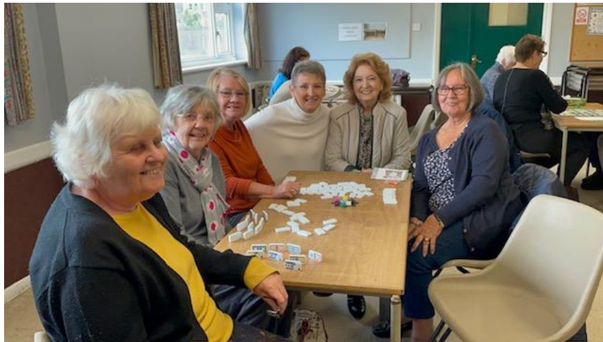
Few Photos of Our Group