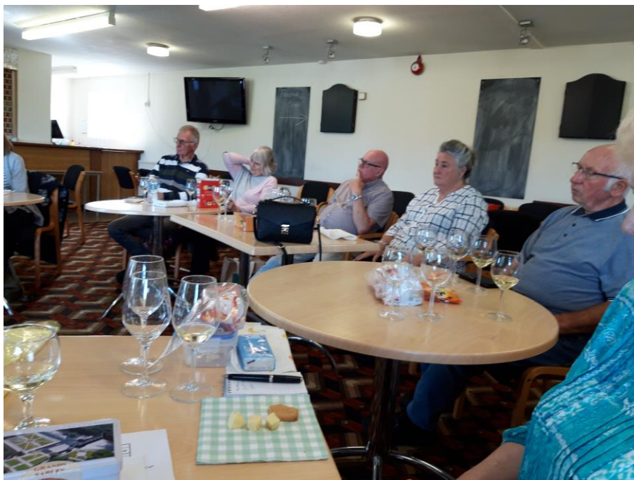
Photos taken at our October Meeting