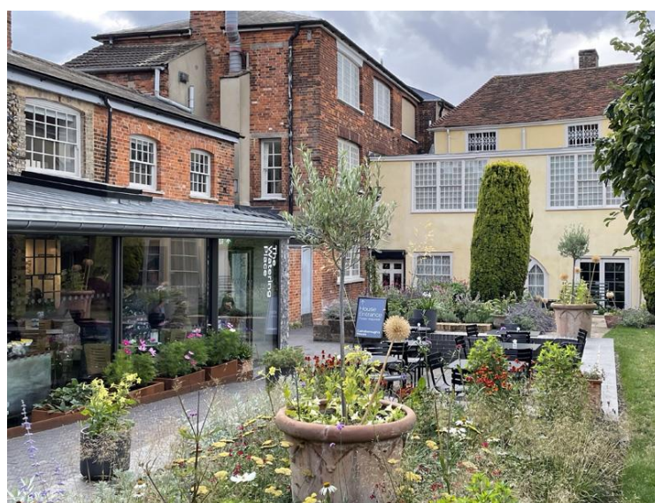
The garden at Gainsborough's House