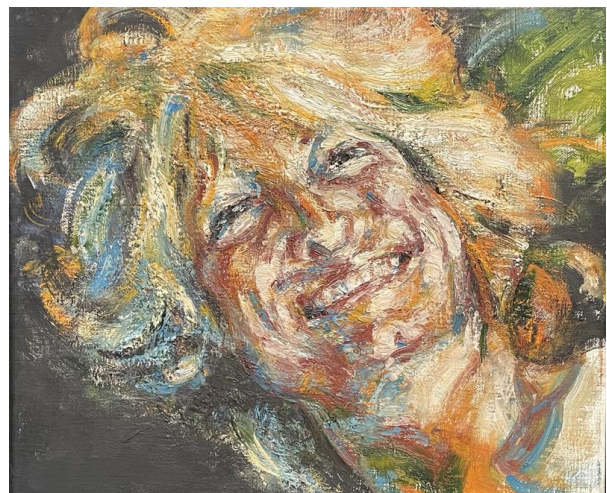
Tory by Maggi Hambling