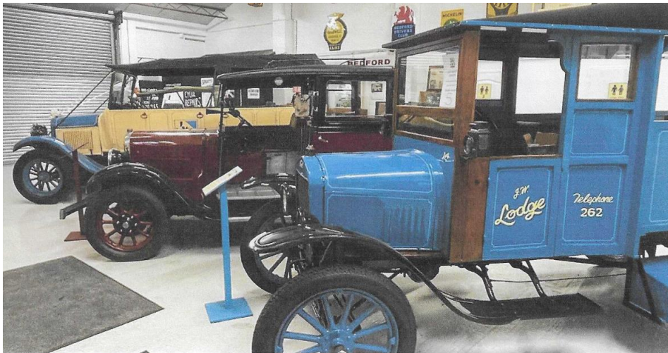
Lodge Coach Museum

https://www.lodgecoaches.co.uk/museum-tour