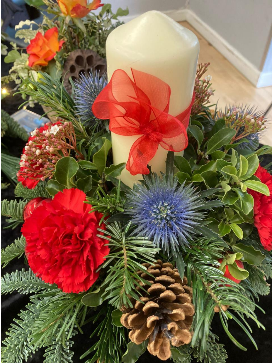
Flower Arrangement from Gardening Groups December Meeting

Quarterly Newsletter - Winter & Spring Edition