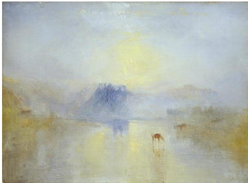
Norham Castle, Sunrise. J.M.W. Turner (c. 1845-50)

Our programme for 2023 completed with a guided visit to the Turner Galleries at Tate Britain. Below is one of Turner's most iconic paintings. Norham Castle, Sunrise on the River Tweed. Turner returned to this place a number of times during his life, and it was the inspiration for one of his greatest paintings of light and atmosphere.