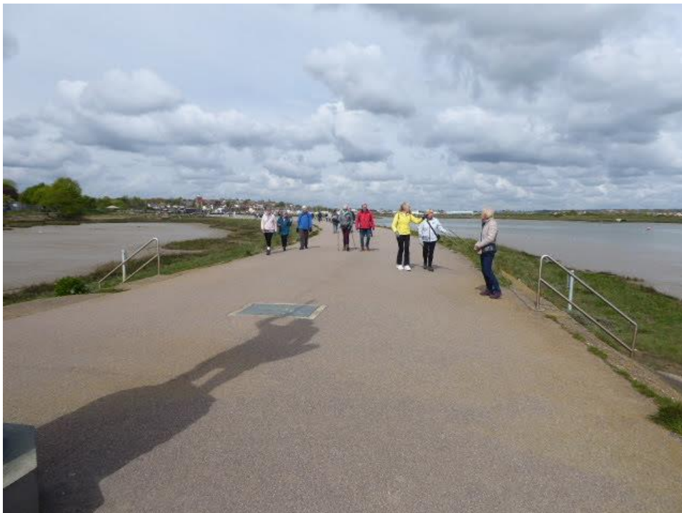
Nice day for a stroll along the prom