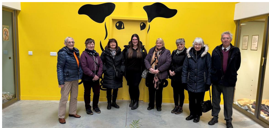
Members at Recent Visit