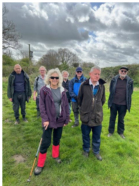
Recent Bicknacre/Cock Clark Walk

The walking group continues to walk regularly on the first and third Friday of the month. Numbers on walks have dropped off a bit during the winter month and of course the extremely wet weather has not helped, so we could do with a few new members. Walks are between 5 and 7 miles with the distance been published in advance. If you think you might be interested, you can just turn up or have word with me and I can give you more information. Do remember though that our walks can be muddy, so proper walking boots are essential.