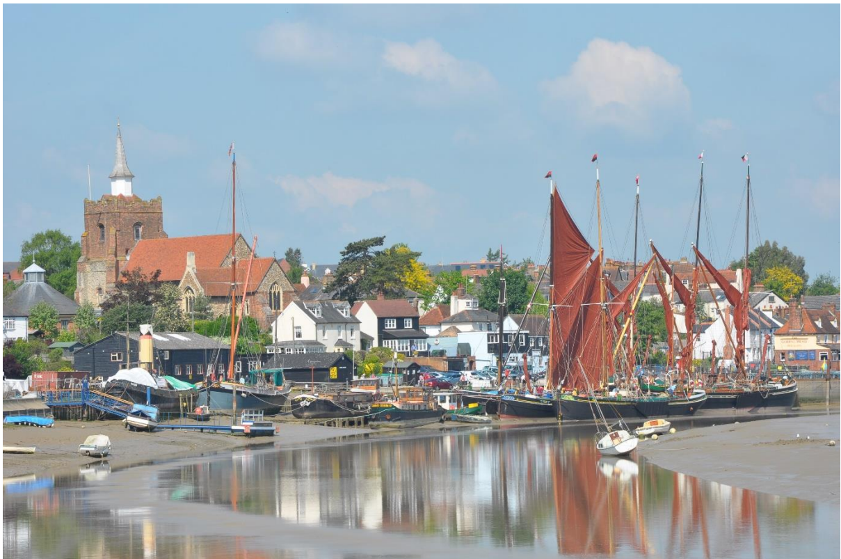
Riverside View of Maldon