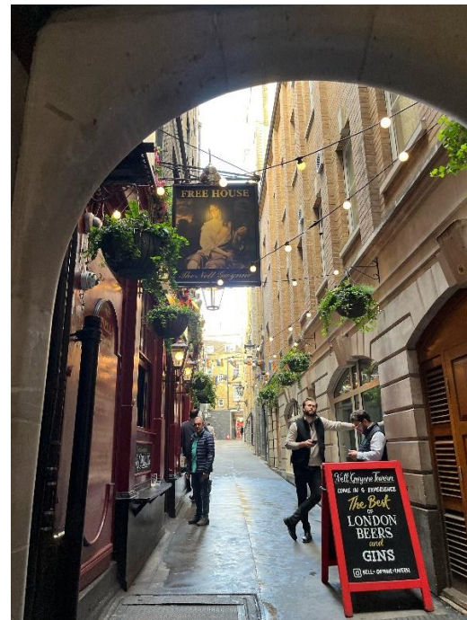
Nell Gwynne Pub in the Strand

In November our walk is entitled Eating Christmas which will give us an insight of Christmas food past and present.