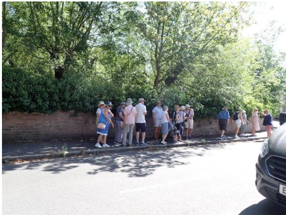
En route to the Rectory - Bradwell

Our August visit to Bradwell was very good, our guide took us around the village pointing out the buildings of interest and giving us a glimpse of life in the past in the village, The two highlights were being allowed into the now privately owned grounds of the former Rectory, a beautiful Georgian house which had been built adjoining a Tudor house, and one of the gardens of another Tudor House which had a Georgian front. Around 75% of the buildings in the village are listed so there are plenty of interesting buildings to look at as well as the Church.