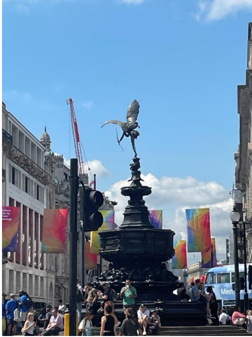
Monopoly Walk - Piccadilly Circus