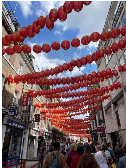
A Soho Saunter