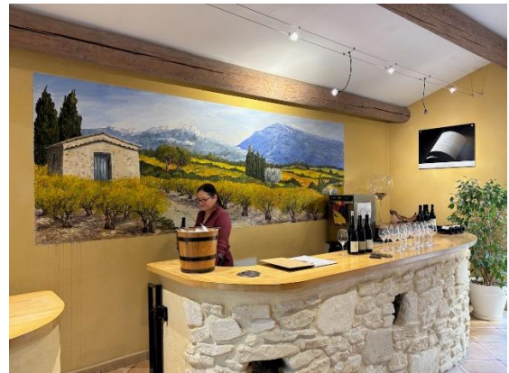
Wine guide preparing tasting