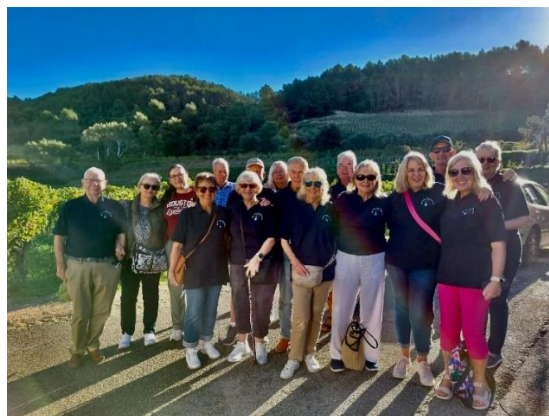
The group Photo in Vaqueyras