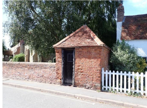
Local Jail - Bradwell

We will be starting to organise our programme for next year soon, if you have any ideas then please let us know.