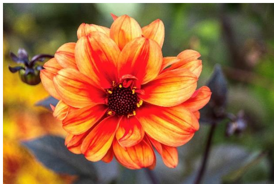
Recent photos taken by the group