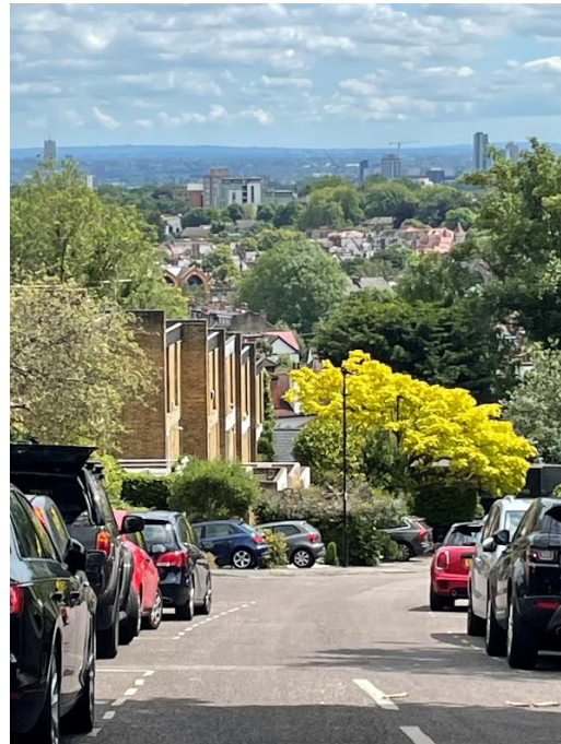
Highgate Village - View towards the City