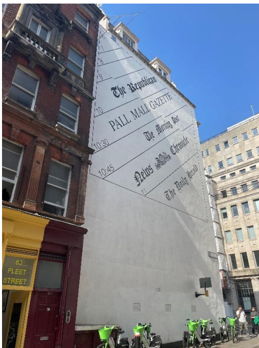
Publish and be Damned - Fleet St