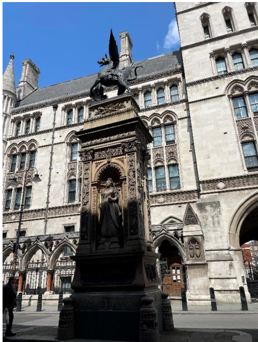
London A Heart of Stone - Law Courts