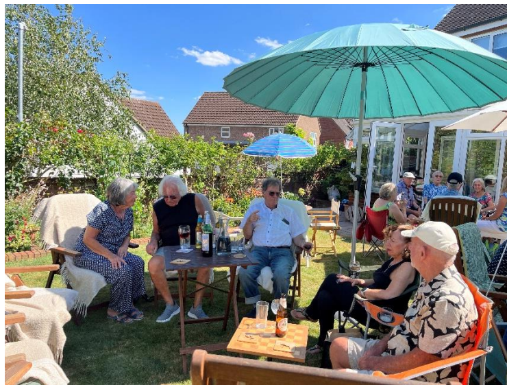
Few pictures taken at Summer BBQ