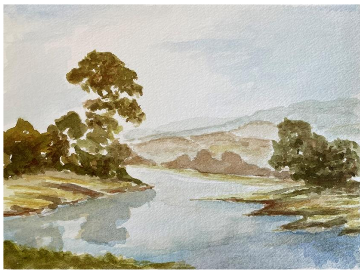
All are examples of Atmospheric Perspective