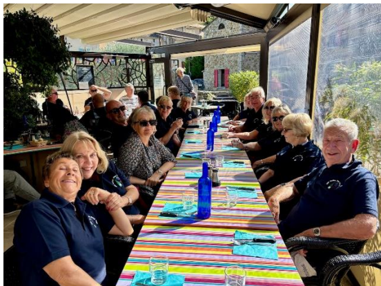
The Lunch in Gigondas