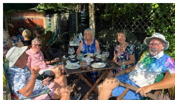
Summer Gin tasting