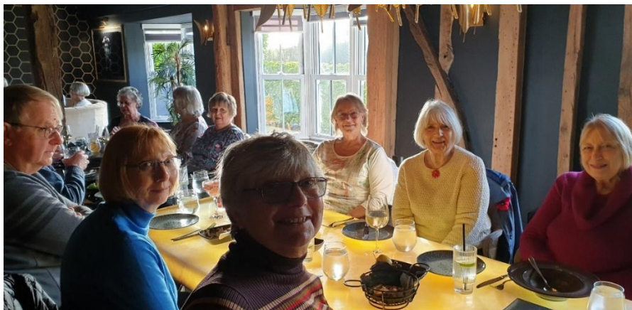
Christmas Lunch at Taz