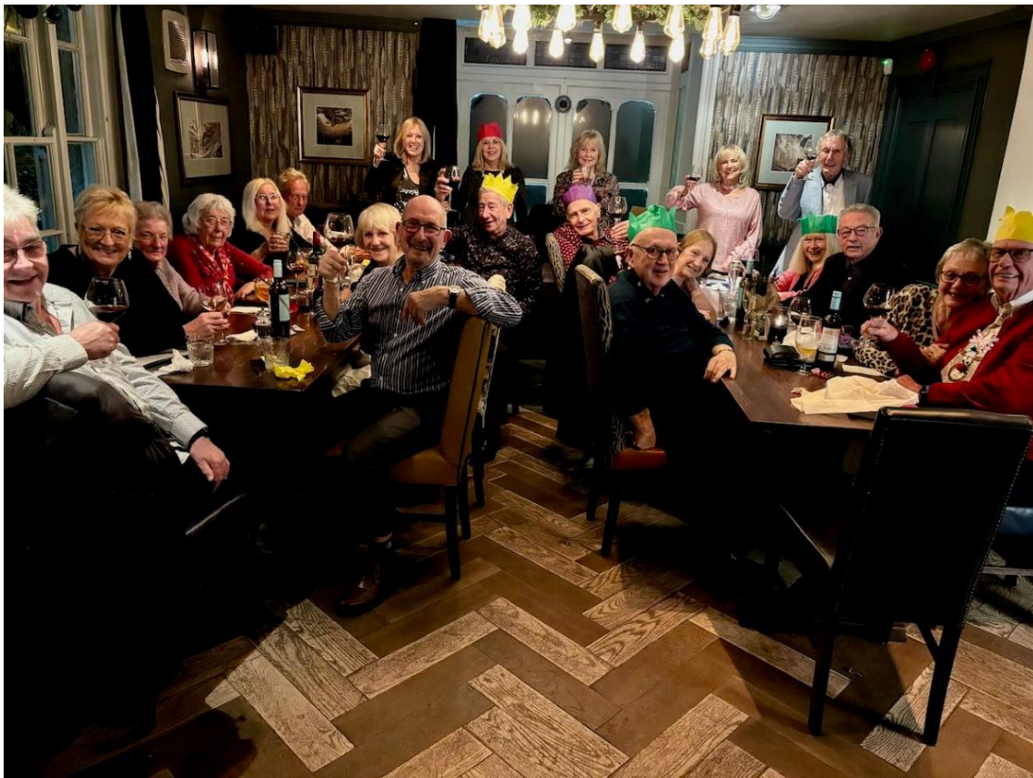
Wine Group 2 - Christmas Dinner at The Hawk, Battlebridge