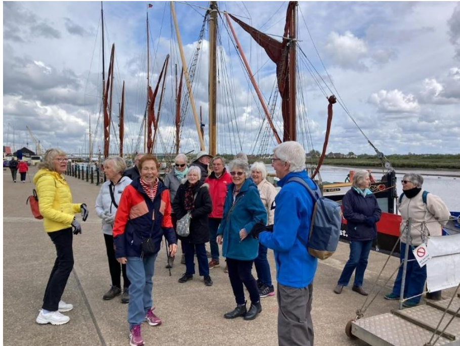
Strollers on a recent Maldon stroll

If this sounds of interest to you, we would love to hear from you.