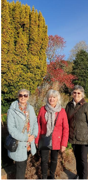
Hyde Hall Visit