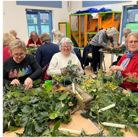
Producing Christmas Decorations