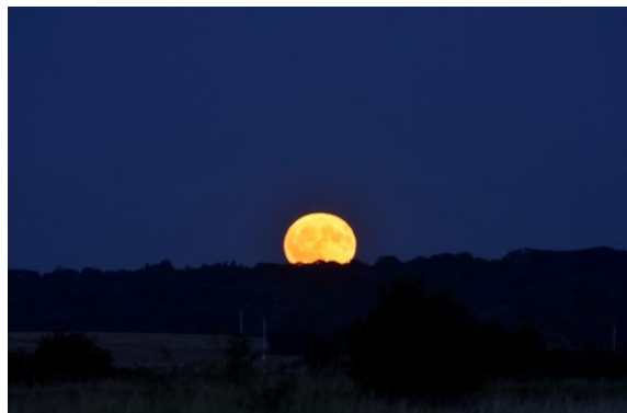
Examples from the Photographic Group