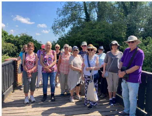
Strollers in Maldon

Our U3A group has a variety of walks available. The Strollers Group has been in existence for about 15 years and are normally flat walks of 2 to 3 miles in length and last about an hour and a half, walking at a leisurely pace. They are normally quite local but sometimes in the Brentwood or Burnham on Crouch area. The walks are on the Fourth Monday of the month.