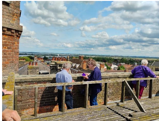
Maldon from the Roof - Moot Hall

the roof. The climb up the steep, spiral, stairs was well rewarded with the views over Maldon from the roof.