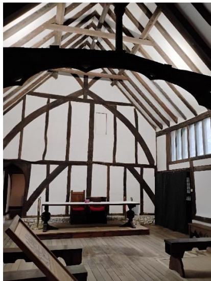
The main Hall at Southchurch Hall

In June we visited Southchurch Hall in Southend; a rare medieval, moated manor house which was built between 1321 and 1364. The Hall was home to farming families until the 1920s. In 1930 it was extensively restored and presented to the town of Southend, serving as the local library until the mid 1970s when it became the museum. We had a guided tour around the house and time to explore the gardens. If you missed the visit, it is open Wednesday to Sunday, 11-4.