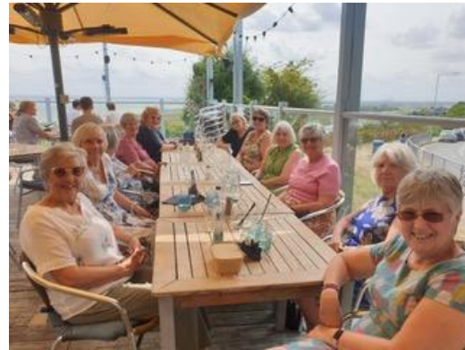
Some photos taken on recent visits