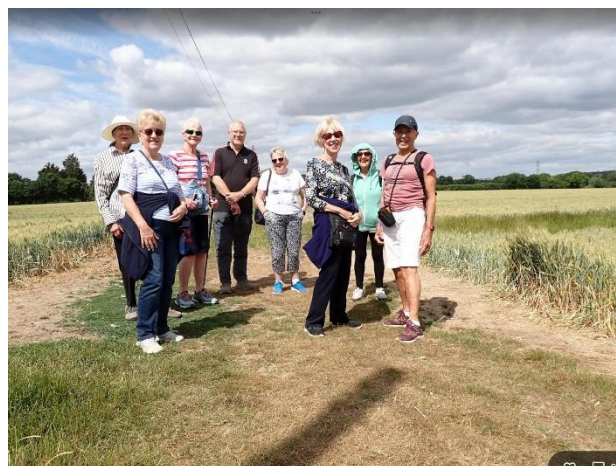
Striders in Burnham

We also have the Striders Group . Striders walks are 4 to 5 miles in length and last about 2 hours walking at a slightly brisker pace than the strollers group and can include stiles or a moderate incline however, some U3A members walk with both groups. Striders walks are normally within Ten miles of South Woodham Ferrers.