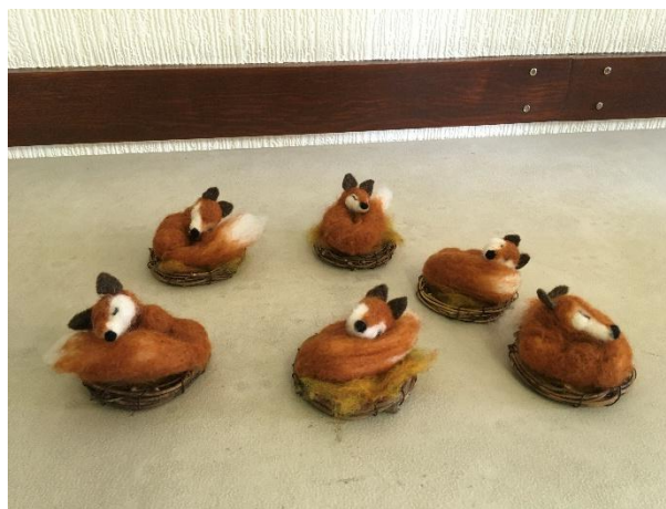
Some of the work we have recently produced