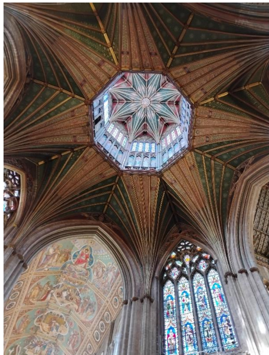
Ely Cathedral and Octagon Tower