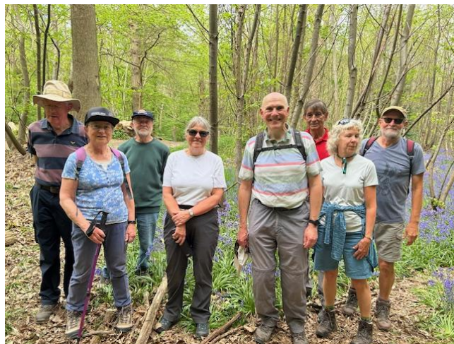
Walking Group in Blake Wood

https://swf.u3asite.uk/u3a_groups/walking/