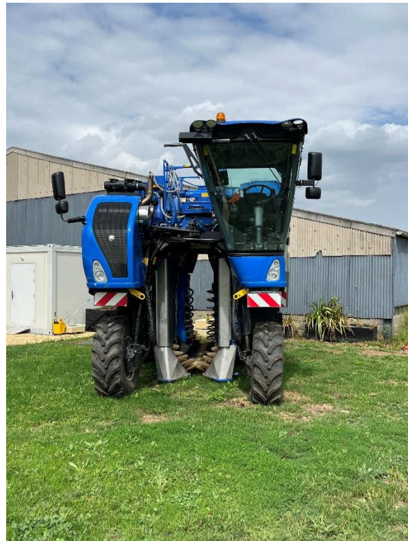
New Hall Visit