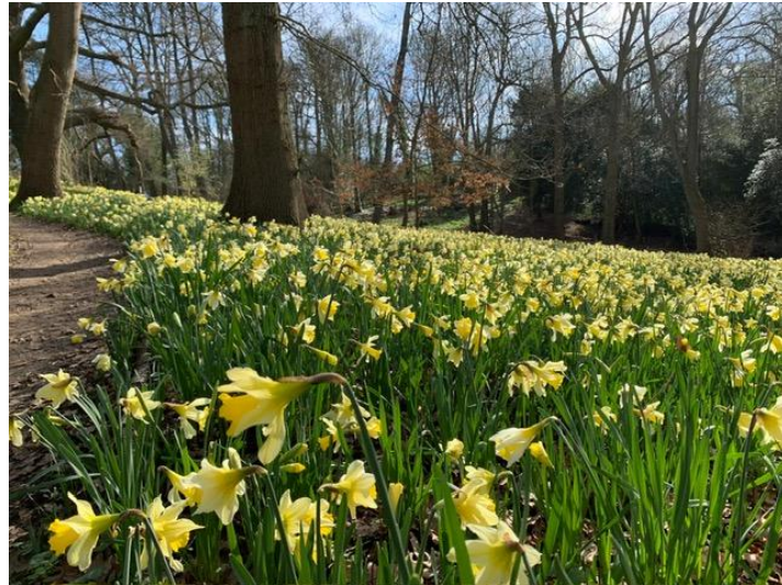
Warley Place daffodil's

The walk is only 1.5 miles about a third of a normal Striders walk but there is so much to see at this time of year our walk lasted almost Two hours, about the same time as our lunch spent in the Thatchers arms next to the reserve, so a pleasant trip!