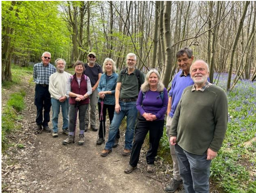
Blake Wood Walk